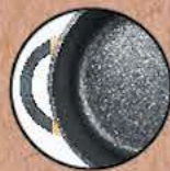
3 Layer Non-stick Coating