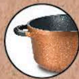
DIE Cast Body

When it comes to cooking, you need a special cookware that doesn't overcook, but also cooks with a closed lid in order to preserve the aroma and nutrition. Striking the perfect balance, here's Prestige Relish Cookware that lets you cook with a closed lid, so that you can enjoy even cooking, tender textures along with wholesome flavour and aroma.